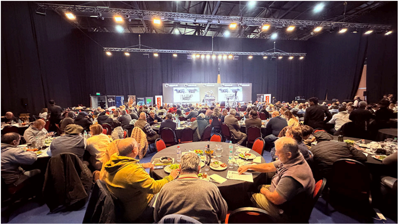
▲ 83rd Angus Autumn Indoor Exhibition. The traditional lunches held as part of Angus Week were catered by the renowned company Borsalino Eventos de Campo.