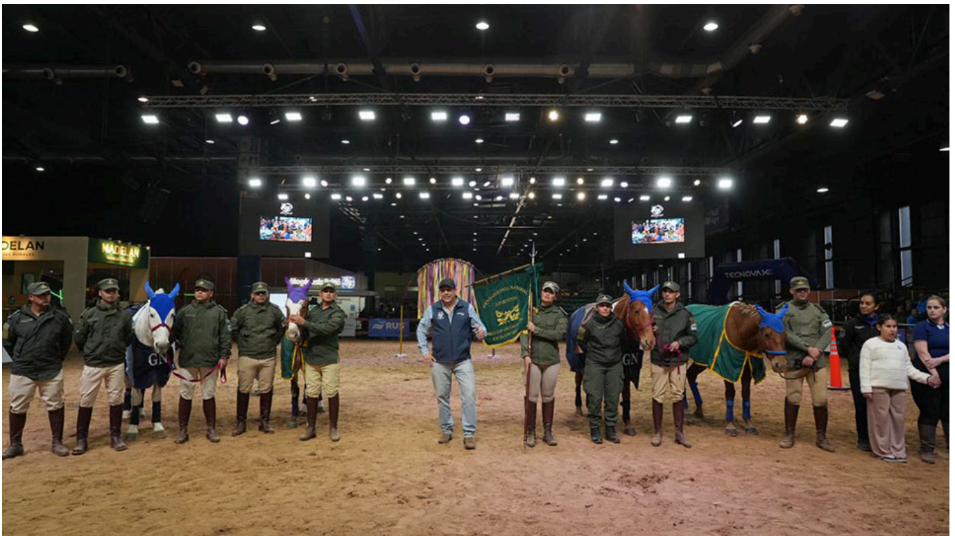
The legacy of a historic week